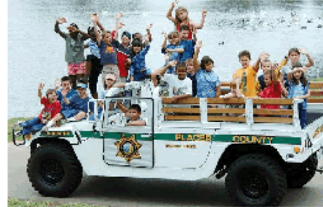
LOCAL DARE GRADUATES RIDING IN THE SHERIFF'S HUMVEE