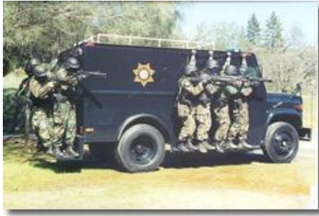
Placer County's Special Enforcement Team (SET)