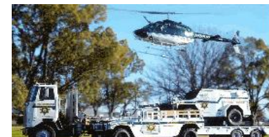
Falcon 30 hovers over other department assets.

The Sheriff's Council is committed to raising funds to support the mission of the Sheriff's Office, helping to obtain equipment and necessities that budget strapped public agencies cannot afford - equipment they need to effectively protect us and themselves.